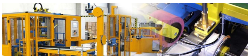
Cable Certification Centre - Televes supervises all the quality parameters of each wound meter of Trishield cable in its own premises.